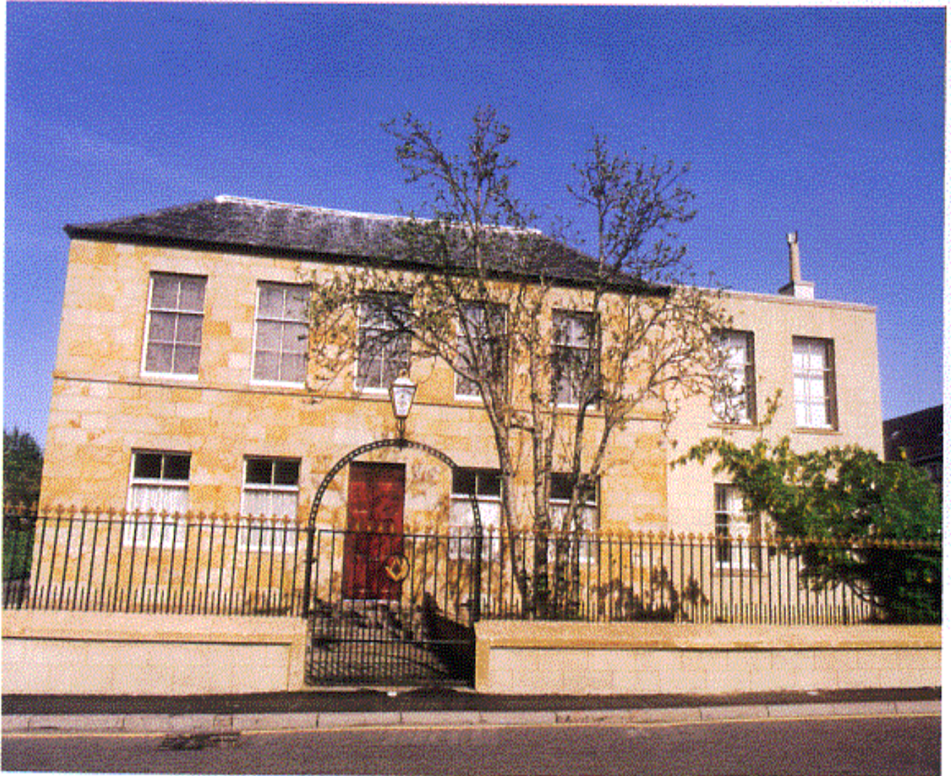
Lodge Fortrose No 108